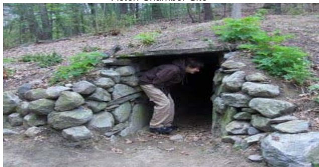
Acton Chamber Site

12:00pm: Holliston town forest near Mavor and Dix's "source of waters": a large expanse of undisturbed "ritual landscape" including a multitude of cairn fields, perched boulders, stone mounds, serpentine walls, split boulders, a drum stone and the huge perched boulder George Washington is reputed to have tried tipping over and failed.