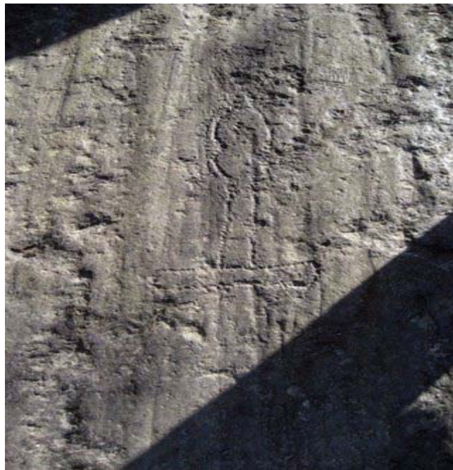
Medieval Battle Sword pommel, hilt and blade punched-marked into bedrock at Westford, MA