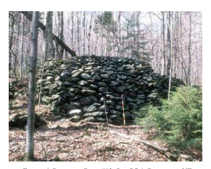
FIGURE 4. PLATFORM CAIRN #13, SITE R7-1, ROCHESTER, VT.

One of the first cairns one encounters if climbing uphill from country road FR61 is platform cairn #13, called the "turtle" on account of the head-like projection at one end (FIGURE 4). Constructed on a steep slope, it measures 21.5' long, 12' wide and varies from 2' to 8' high. Based on measurements I provided to Herman Bender, a colleague in Wisconsin, the cairn contains approximately 10,000 rocks.