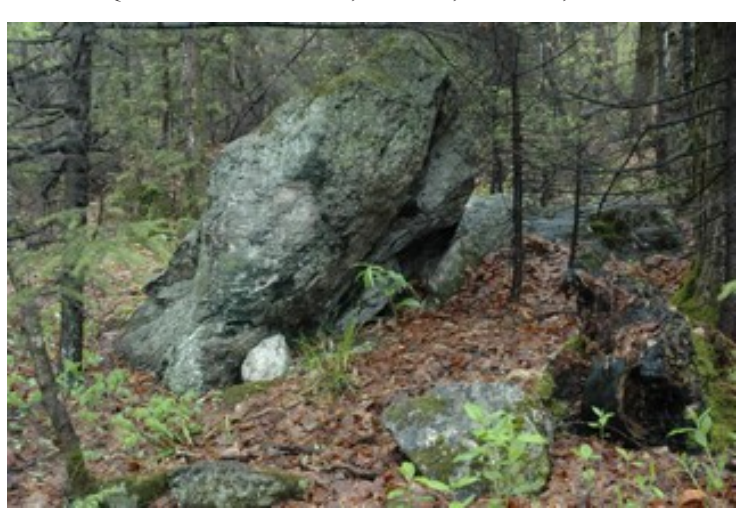
FIGURE 6. FEATURE F2, SITE R7-1, ROCHESTER, VT.