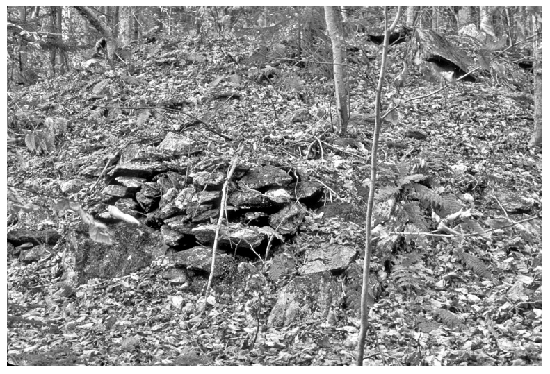
quartz was used for some of the cairns in Vermont, Figure 9. Terrace cairn at Site R7-1, Rochester, VT.

Cairns and other stone features are often regarded as isolated objects to be studied independently of other considerations. But by being sensitive to the object and the landscape in which they are placed, we can often gain insight into the relationship between them. Within the past fifteen years or so, some of the focus on rock art (petroglyphs) has been on its relationship to the surroundings in which it is found, which are often quite spectacular. Some researchers, such as Steinbring (1992, 2000), Taçon (1991), Tilley (1994), and