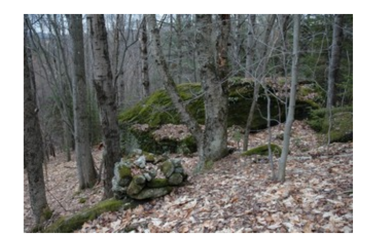
FIGURE 11. ERRATIC (LEFT) AND CAIRN ON BOULDER (RIGHT) AS SEEN FROM THE EAST, SITE R7-2, ROCHESTER, VT.

cairns such as these nearby or anywhere else on the site, and it is my contention that they were constructed in response to the phenomenal characteristics of the erratic. Within a mile of this site is a low quartz platform built against the west side of a large erratic, and two large spectacular boulders at two separate sites have rock caches piled against one side. In each case the size and shape of the boulders convey a "presence" that, to the Indians, was indicative of Manitou (Bender 2003). We look at landscape through twenty-first century eyes, full of scientific understanding of geological processes that formed the present landscape but lacking any wonder, any mystery. In order to truly understand landscape as the American Indians did, we need to rid ourselves of all cultural preconceptions and approach it as would a child, full of wonder at the curious shapes that beguile it, and imagining all kinds of mysterious processes that created these forms. By doing this, we might discover a deeper understanding of rock features as they were perceived by the Indians and also of the landscape in which they are found.