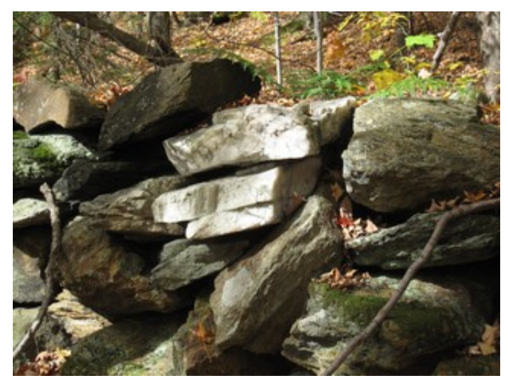
FIGURE 5. QUARTZ SLABS ON CAIRN #8, SITE R7-1, ROCHESTER, VT. Photo: N. Muller

The source of the quartz for the two features mentioned above was a wide quartz vein or outcrop Figure 7. Stone pavement at northeast end of boulder, Feature F2, Site 150' from the propped-up boulder and 250' from the R7-1, Rochester, VT. Photo: N. Muller