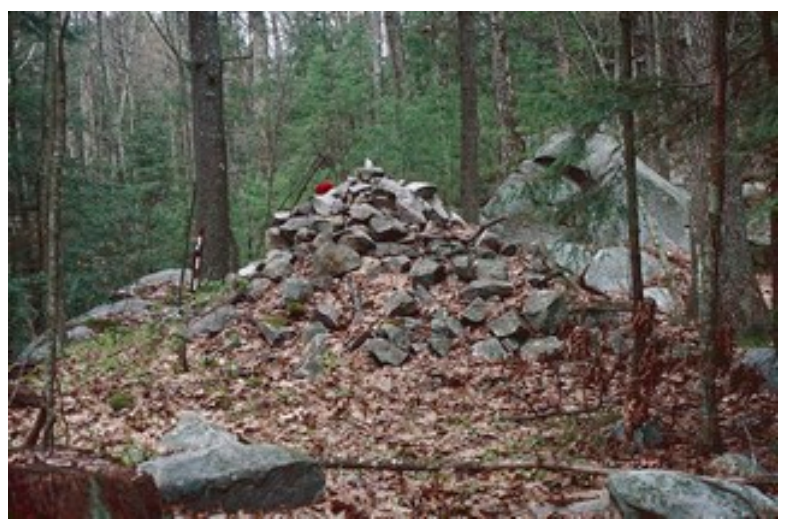
FIGURE 1. COMMEMORATIVE CAIRN AT MONUMENT MOUNTAIN, STOCKBRIDGE, MA.

159). In 1960, Kellar wrote a comprehensive article on stone mounds in the eastern United States, and said that many are found on "high knobs, ridges, and mountainous regions in the upland sections." (Kellar, 1960: 447). Some, too, are associated with geometric earthworks, and still others are found within the walls of hilltop "forts," such as the huge one (12'x 129') at Glenford, Ohio, which has been dated to 2220 \pm 50 B.P. (Dutcher, 1988).