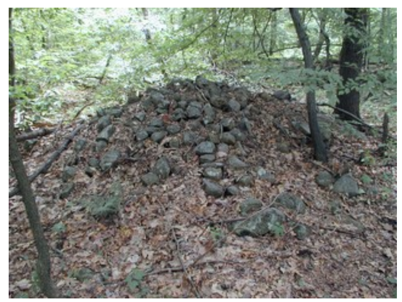
FIGURE 2. PROBABLE BURIAL CAIRN AT OLEY HILLS STONE MOUNDS SITE, PA.

Stewart's study of stone burial mounds in Maryland described them as generally being in a "high terrace/upland setting," and nearly always near a water source (Stewart, 1981: 7). Many were from 12 to 20 feet in diameter and from 6