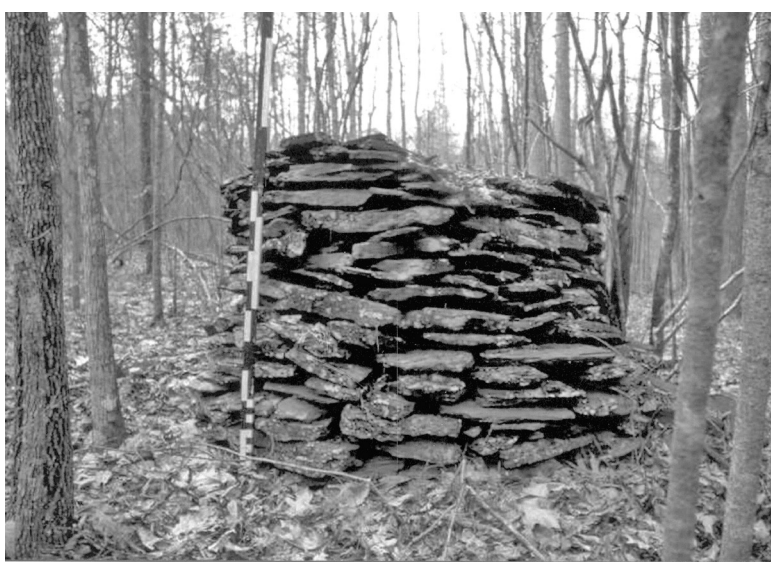
FIGURE 3. STACKED CAIRN AT STRICKLAND MOUNDS COMPLEX, GWINNETT CO., GA.

Gresham's article was critical of the Parks-Strickland site that Garrow had investigated in 1988 and which he had listed on the National Register of Historic Places in an attempt to prevent its destruction through development by claiming the cairns were prehistoric. As described by Garrow, "The Parks-Strickland Complex...consists of two clusters of stone mounds located on narrow benches on steep slopes overlooking the Little Mulberry River (in Gwinnett County). The Parks mounds...occupy two narrow benches between elevations of 1056 and 1068 feet AMSL. Thirteen mounds were identified on the lower bench, while 17 were found on the upper feature. The Strickland mounds are located approximately 300 feet east of the Parks cluster between elevations of 1060 and 1100 feet AMSL, and separated from the Parks mounds by a deeply entrenched stream that flows into a tributary of the Little Mulberry River...A total of 153 mounds have been described in this mound cluster." (Garrow, 1994:3-4). It should be emphasized that the mounds in this complex are of the stacked variety (Figure 3). In Garrow's 1994 report/rebuttal to Gresham, he listed five reasons why he believed the cairns were prehistoric; these are also found in his 1988 report: