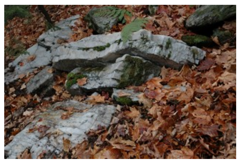
Figure 8. Exposed quartz vein at Feature F3, Site R7-1, Rochester, VT.

"boat" cairn (FIGURE 8). Here we not only have the source of the quartz, but also proof that this mineral was deliberately sought out and integrated into the two structures. The quartz vein needs to be cleared of leaves and other debris to determine how far it extends and how much of it was mined. Each of the cairns should then be carefully studied to see how many more contain similar types of quartz. Measuring the thickness of the quartz pieces and recording the plane orientation and the color should establish whether any other pieces came from the same source.