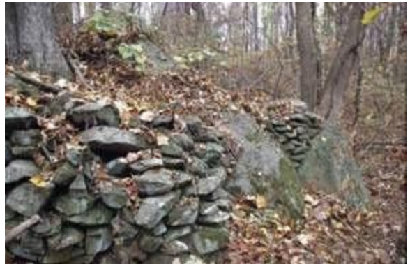
Fig. 15 Fig. 16