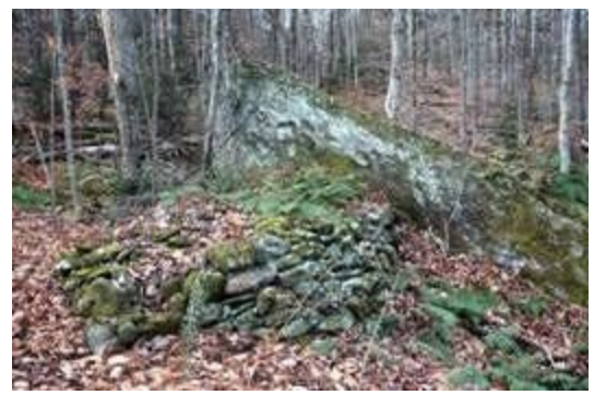
Fig. 8 Fig. 9

rock at right angle to the axis of the boulder, as if to emphasize the importance this boulder held for the Indians who came to this site. Besides its unusual shape, the boulder consists of banded gneiss with large amounts of quartz inclusions (Fig. 10), which may have made this unusual boulder even more special and powerful.