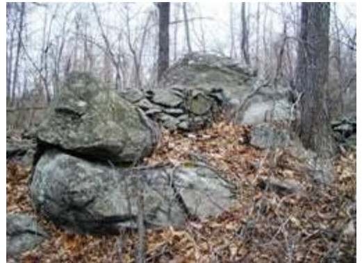
Fig. 12 Fig. 13

the two boulders. My own feeling is that this particular feature was singled out for attention because of the female connotations of this shape. To a certain extent we see it at the Row-Linked Boulders site only a hundred yards or so away, where a gap between two boulders was filled in with stones (Fig. 13). The fill at this feature is more U-shaped than a V, but I believe there was a similar mindset at work in constructing this. At a site in South Newfane, VT, we find a feature nearly identical to the one at the Terraced Boulders site (Fig. 14), in which a V-shaped depression has been filled with stones, again forming a distinctive delta shape.