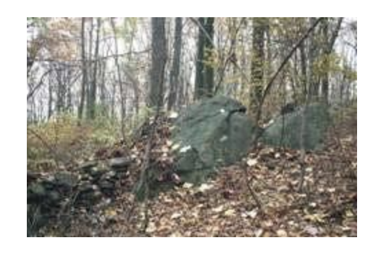
Fig. 4 Fig. 5

Many natural stone features were chosen for enhancement because of some distinctive shape that reminded the Indians (assuming they were the ones responsible for most of the distinctive stonework at the site) of some animal. In this case, I believe the right side of this boulder complex, as seen from this angle, reminded the Indians of an upraised turtle head (Fig. 6), with the boulders to the left representing the carapace. Stones, clouds, configurations of trees, etc., when they appear to look like a known animal are called simulacra (Devereau 2000: 30-32) Sometimes the resemblance is remarkable and unquestioned, such as an obvious turtle effigy at Killingworth, CT (Fig. 7). Another