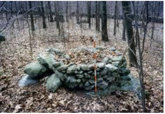
Fig. 6 Fig. 7